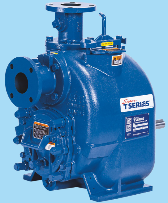
Shown with Optional Suction and Discharge Spool Flanges (Available in ASA or DIN Standard Sizes).